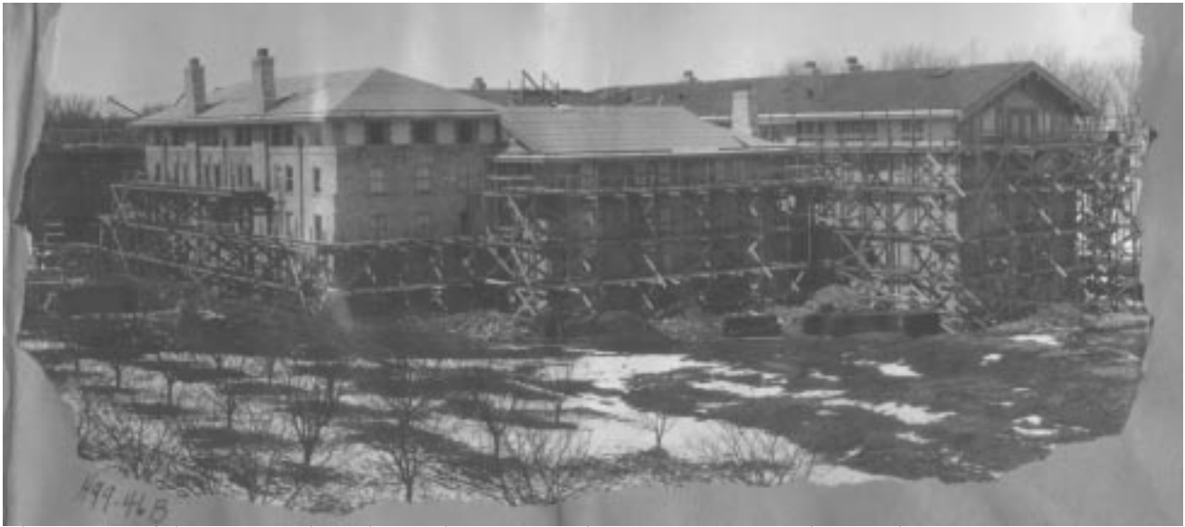
Fig 3. One of the two quadrangles under construction 1926. [Meuer photo vol. 12, p.132, M198]

it was a spectacular success is due in large part to the skills and thoroughness of the men on this committee.