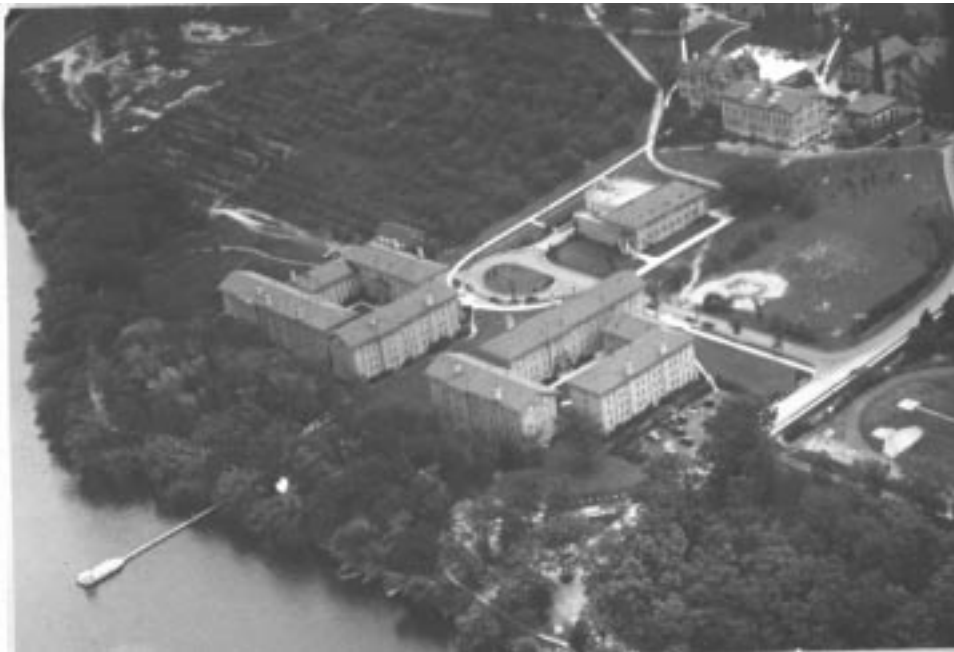
Fig 2. Van Hise dorms c. 1930. Tripp, Adams, and refectory, with King Hall in background. Note that the area east of Tripp Hall, now a vast parking lot, was at that time still in use by the agricultural college as experimental plots. [series 26/1, Exterior Views, Tripp and Adams, x25-1912]