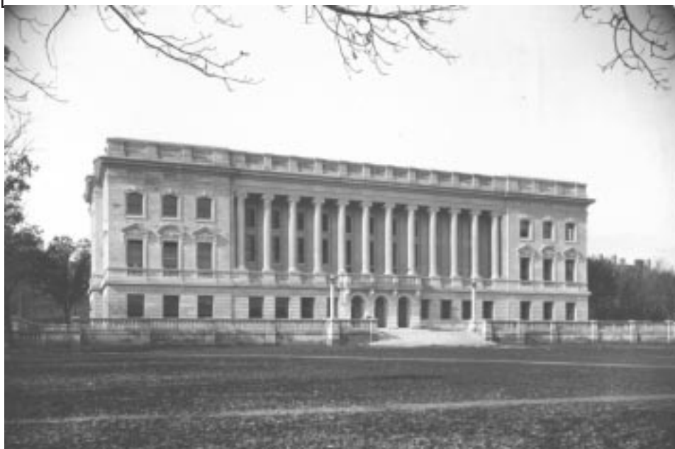
Fig. 1. The State Historical Society Building in 1900. Four stories of steel and Bedford limestone, the windowless fourth floor is hidden by the entablature. [9/2 Historical Society folder jf-24]

This building was constructed for use by both the University Library and the State Historical Library, and opened in 1900. The north stack wing was added in 1914. The University left the building in 1950 for Memorial Library. The last large modification was the west addition in 1965.